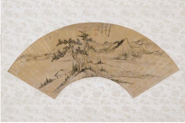
Figure 4. Landscape painting on paper folding fan, by Li Liufang 李流芳 (1575–1629), 1627. 16.5×51.7 cm. Collection of Tokyo National Museum.

open and close, and he ordered [palace] artisans to make fans following that model” (Lu Rong, Shuyuan zaji , 5.53). Fan-making workshops were thus established to produce more fans that Yongle liked, and perhaps also to follow the new fashion trend. They were not limited to the lower Yangzi Delta region. Palace artisans and regions with a long tradition of producing round fans and good natural resources for doing so, such as Sichuan in southwestern China, also joined in. According to an early seventeenth-century source, Sichuan was at first designated to send 11,540 folding fans to the imperial court as local tribute, and by 1551 the number had already increased by 2,100 (Shen Defu, Wanli yehuo bian , 26.662). Some Ming literati also started drawing landscape paintings just for paper folding fans, and this practice gained increasing popularity in intellectual circles (see fig. 4). Later, the albums containing folding-fan-sized paintings were even exported to Japan and became references for Japanese craftsmen (Shi 2010: 19–40).