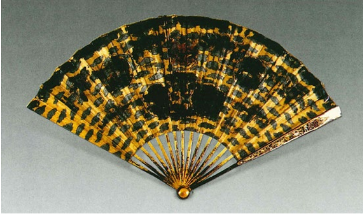
Figure 3. Folding fan with bamboo skeleton and silk paper. 32 × 55 cm. Excavated from the tomb of Zhu Yiyin, King Yixuan of the Ming dynasty 益宣王朱翊鉞 (1537–1603). See Jiangxi sheng bowuguan 江西省博物館, ed., Jiangxi Mingdai fanwang mu 江西明代藩王墓 ( Ming-Dynasty Prince Tombs in Jiangxi ). Beijing: Wenwu Chubanshe, 2010, pl. 62.6.

and imperial family members in the lower Yangzi Delta. At least sixty-five folding fans were found in seventeen Ming tombs, and they were commonly placed near the tomb occupants. Many of the fans were in the Japanese style, with a solid gold ground or with many gold dots spread across the paper surface (see fig. 3; Xia 2008: 79).