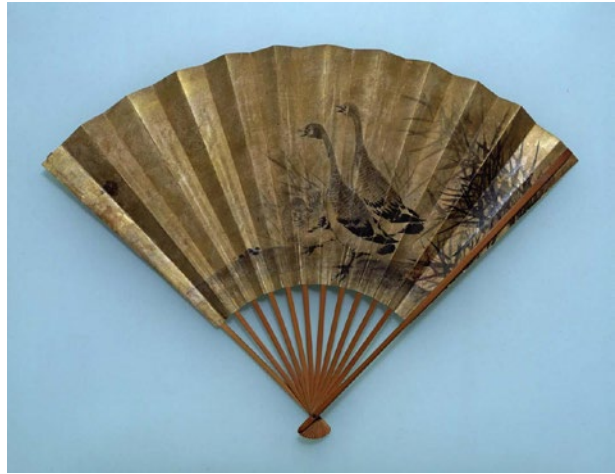
Figure 2. Paper folding fan by Kanō Masanobu 狩野正信 (1434–1530). 18.8×43.3 cm. Collection of Tokyo National Museum.