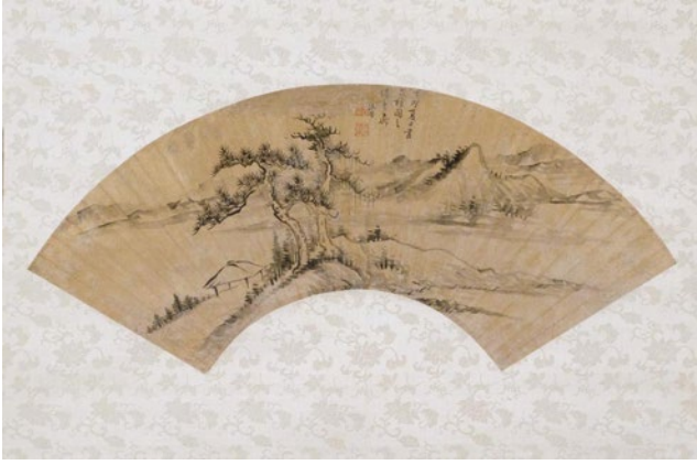
Figure 4. Landscape painting on paper folding fan, by Li Liufang 李流芳 (1575–1629), 1627. 16.5×51.7 cm. Collection of Tokyo National Museum.