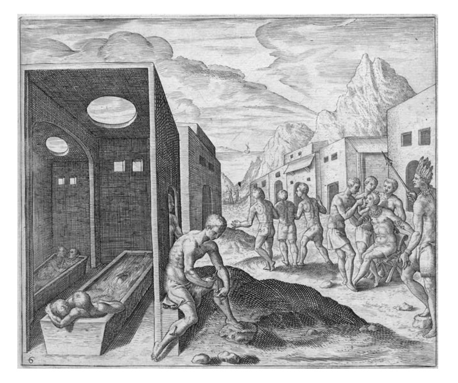
Figure 2. Ormuz. Theodor and Johan Israel De Bry, Ander Theil der Orientalischen Indien (Frankfurt am Main, 1599), plate 6.

having printing five hundred years before Europe ("they much resemble and surpass the ancient Grecians and Romans"), are considered unworthy of visual illustration. Raman reads another moment of European dominance over Asian culture in Linschoten's voyage (see fig 2) in an engraving showing a European ship coming into port at Ormuz on the horizon above a scene across which various foreign practices are pictured. Like the Native Americans, these Asians cannot see and therfore comprehend what is about to happen with the arrival of that ship. The Asian guard in the foreground of the scene, fitted out in a Native American feathered headdress, looks on in ignorance, but the European reader of De Bry's volume can see quite clearly the implications of colonization. The native is blinded and so could not see, even if he were shown it, the book in front of the European reader.