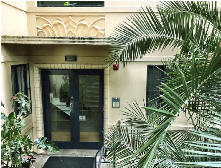
Figure 2. Entrance to apartment building in Elizabeth Bay.

previous year, I had become interested in the long history of reclamations there, and this had led to a broader interest in reclamations as artifacts of human expansiveness. It was now no longer possible for me to be on this wall without being conscious of it as the bounding wall of a reclamation. Following that afternoon at Elizabeth Bay, instead of collecting memories from my old addresses I slipped into a pattern of returning every few weeks to the park and the seawall, partly from the pleasure of having rediscovered the place and partly to try to piece together its history.