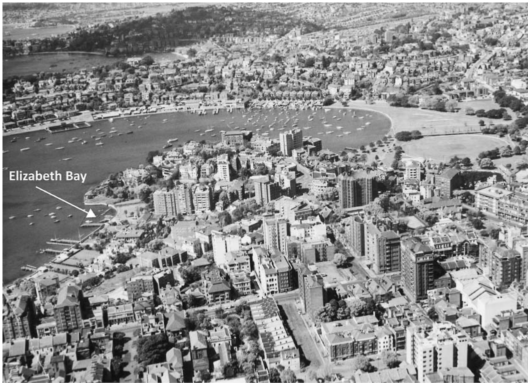
Figure 1. Pre–World War II aerial view with Elizabeth Bay at the left and Rushcutters Bay, center.

material conditions that are handed down to us” and that these conditions—reclamations might constitute one such condition—represent a history that is not purposeful but “emergent and full of unspecified potential.” 13 As portents, reclamations may indeed evoke a future of continued and even intensified human monopolization of coastal ecologies, but they do not determine it. An archaeological sensibility might help us appreciate how and why reclamations have been carried out, how they behave as objects, the nature of our entanglement in them, and the possibilities for less destructive entanglements.