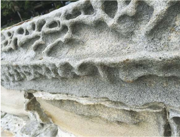
Figure 4. Weathering of sandstone blocks in the Elizabeth Bay seawall.