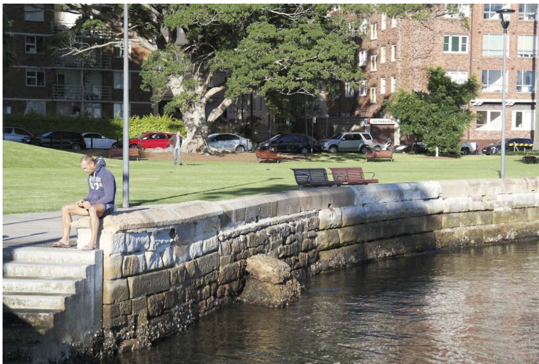
Figure 3. The Elizabeth Bay seawall and reclamation, from the east.

survey to translate the country of the indigenous inhabitants into a tradable commodity. 19 It created a body of capital to underpin and fuel the colonial economy and gave impetus to the subdivision of many of the early land grants. Most of the Macleay estate at Elizabeth Bay, with its formal gardens, pathways, an orchard, and an orangery reaching right down to the beach, was subdivided into residential blocks and sold off prior to the 1880s. On the west side of today's waterside park, a row of the elongated rectangular blocks extended along the curve of the bay, each with its lower boundary reaching down to the high-water line. The owners, however, soon gained government consent to reclaim the space out from that boundary to the low water line. There a sandstone seawall was erected to serve simultaneously as a retaining wall to hold the soil and refuse used to reclaim the area over the beach and as a defense of the reclamation against the sea. The reclaimed land became a seaward extension of the gardens of the large houses that had been built at the landward end of the blocks. To the east of these gardens, the Sydney City Council reclaimed an equivalent band of beach and intertidal mudflat to form present-day Beare Park. The seawall was extended as part of this project so that by the late 1880s it inscribed a gently curving line from one side of the bay to the other (fig. 3). 20