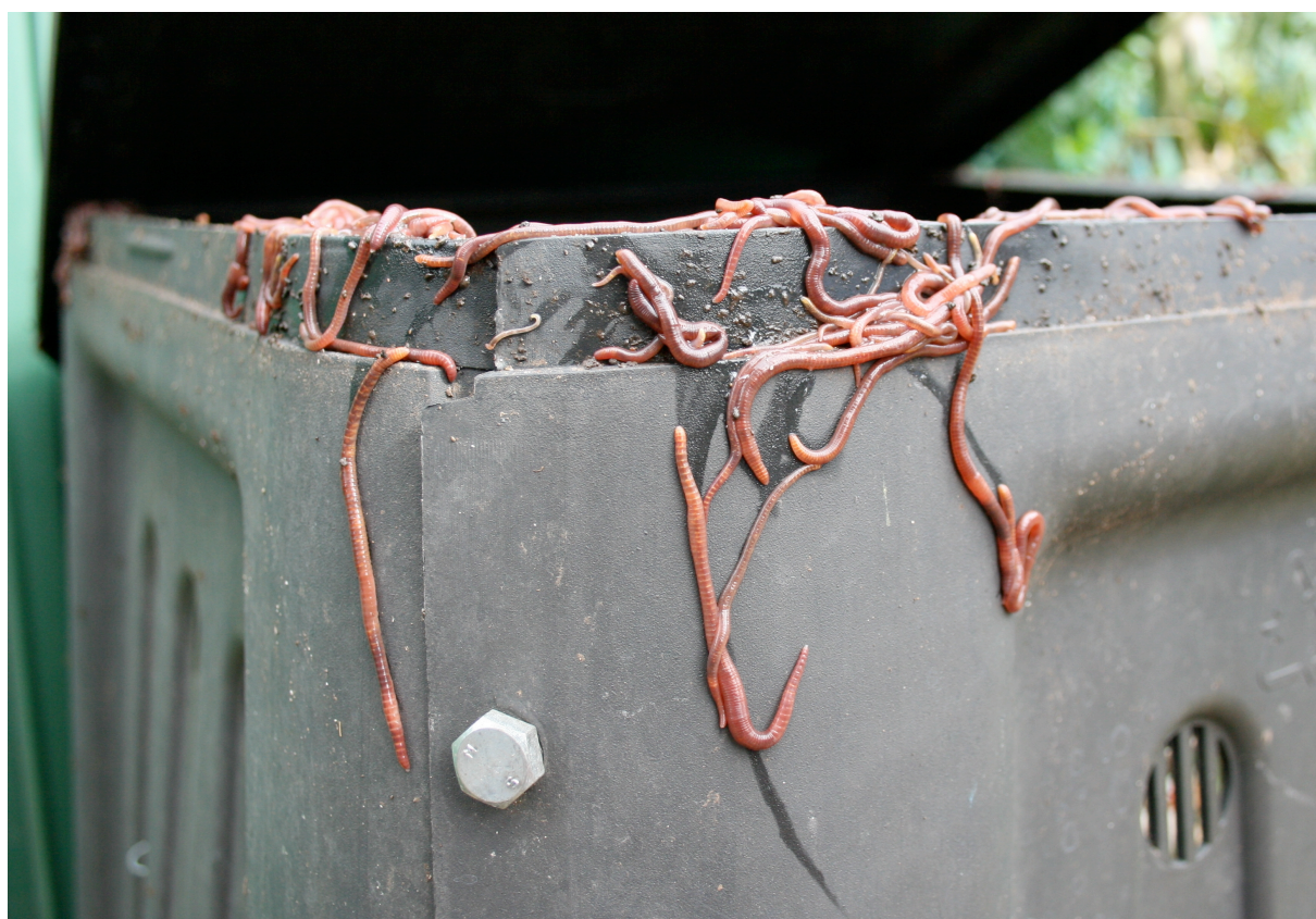
Figure 2 Escaping worms.

From one day to the next, close to 20 worms had left the bin on Sebastian's balcony in Amsterdam. In the darkness of the night, they crawled out and ended up on the tray that he kept underneath the wormery. As usual, he had given them food; he had let them breathe during the day by leaving an open space between the lid and the box; and earlier in the week he had created little pockets of air by scooping around the soil. So, why did they escape?