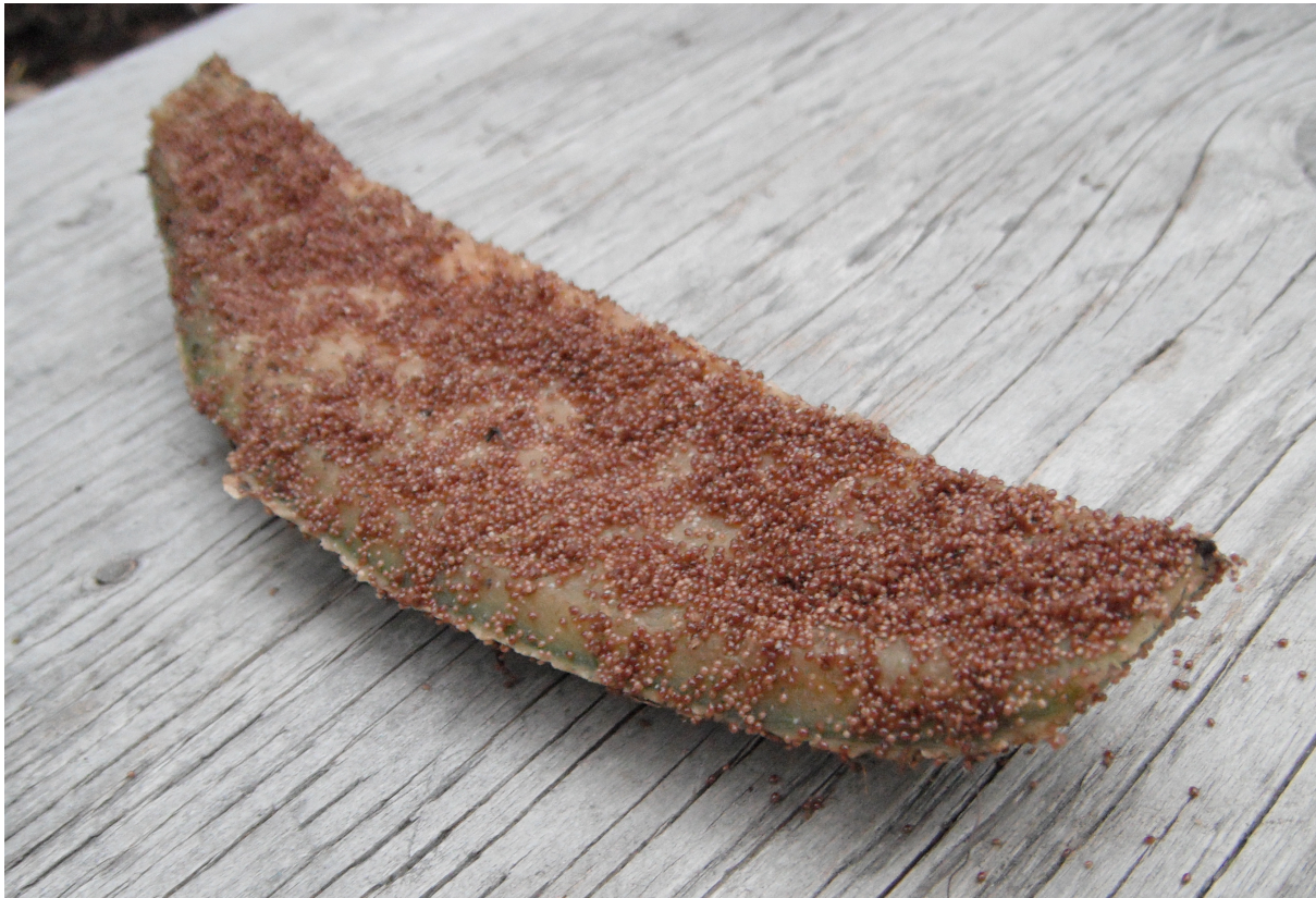
Figure 3 Red mites infestation.

Filippo was away for a few weeks and asked some friends to drop by and give some leftovers to the worms. But when he came back, it became obvious that the food scraps his friends brought had not fed the worms, but the mites that lived in the bin. An explosion of brownish spider-like creatures covered every surface of the bin. While mites were present in the bin also before this event, the population grew so much over a short time that there was no other alternative but to put the bin straight out on the balcony, to avoid having the infestation spreading around the kitchen.