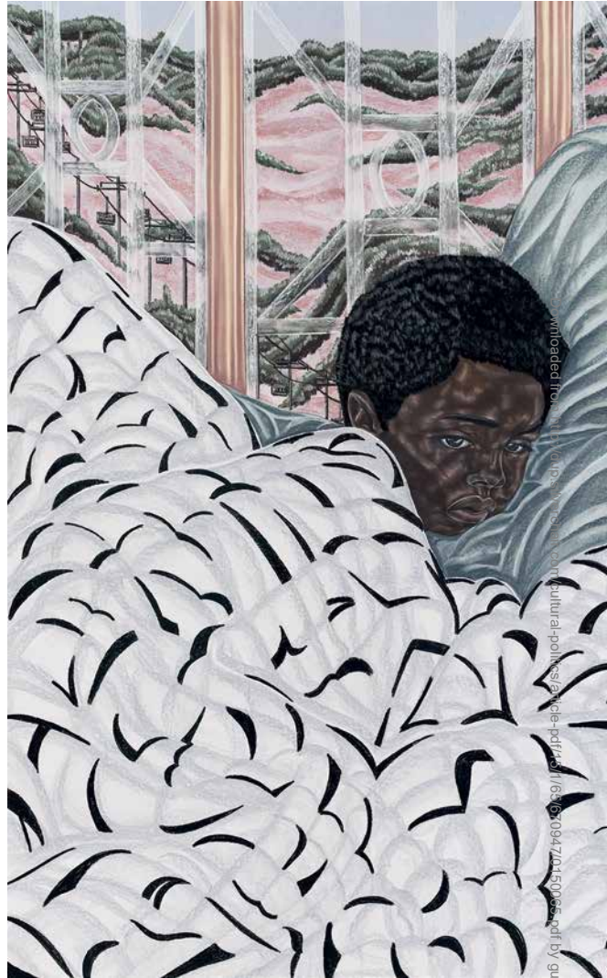
Figure 3 First Night at the Boarding School , 2017. Charcoal, pastel, and pencil on paper, 63¾ × 41½ in. © Toyin Ojih Odutola. Courtesy the artist and Jack Shainman Gallery, New York.

Ojih Odutola is a visual storyteller who layers possible meanings and allusions as conceptual underpinnings, envisioning a world in which blackness is not a unilateral or simple signifier of race. Her visual language suggests an imaginary that is compelling, vibrant, and relevant, especially in opposition to the Trumpian worldview. Some of her art historical influences include two nineteenth-century painters of modern life, John Singer Sargent and James Tissot, while contemporary admired artists who expand the parameters of the representation of blackness and "presumed identity" would include Kerry James Marshall, Lynette Yiadom-Boakye, and the late Barkley Hendricks, the master of the depiction of cool. But for Ojih Odutola, the written word, her fictional trilogy, is an impetus to her visual image making. She has created an epic story about two Nigerian families, the UmuEze Amara and the Obafemi: the first of an ancient noble heritage and the second a nouveau riche family enriched via trade and vineyards, echoing colonialist mercantilism and structural economic inequality. The male heirs from each family have fallen in love and married, a fantasy nurtured by the artist in opposition to actual laws in Nigeria, where being gay and marrying is illegal. Aristocracy and the newly rich thus consolidate their wealth, businesses, property, and privilege, and as part of that consolidation they commission portraits in which their