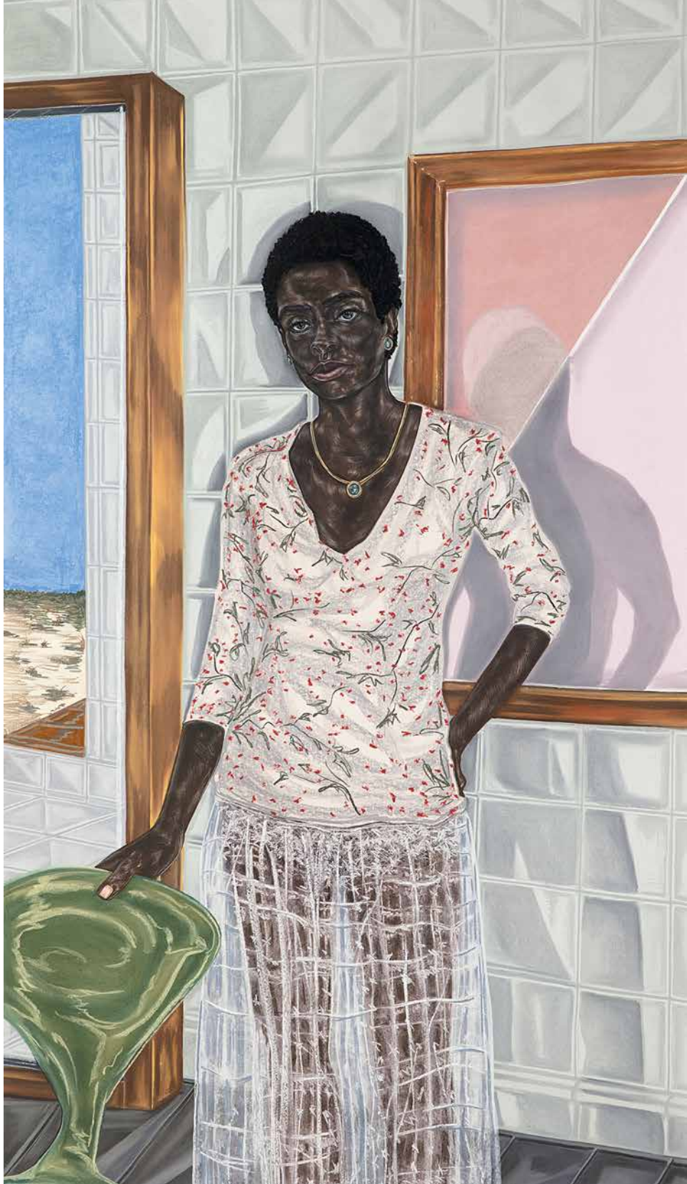
Figure 4 Pregnant , 2017. Charcoal, pastel, and pencil on paper, 74½ × 42 in. © Toyin Ojih Odutola. Courtesy the artist and Jack Shainman Gallery, New York.