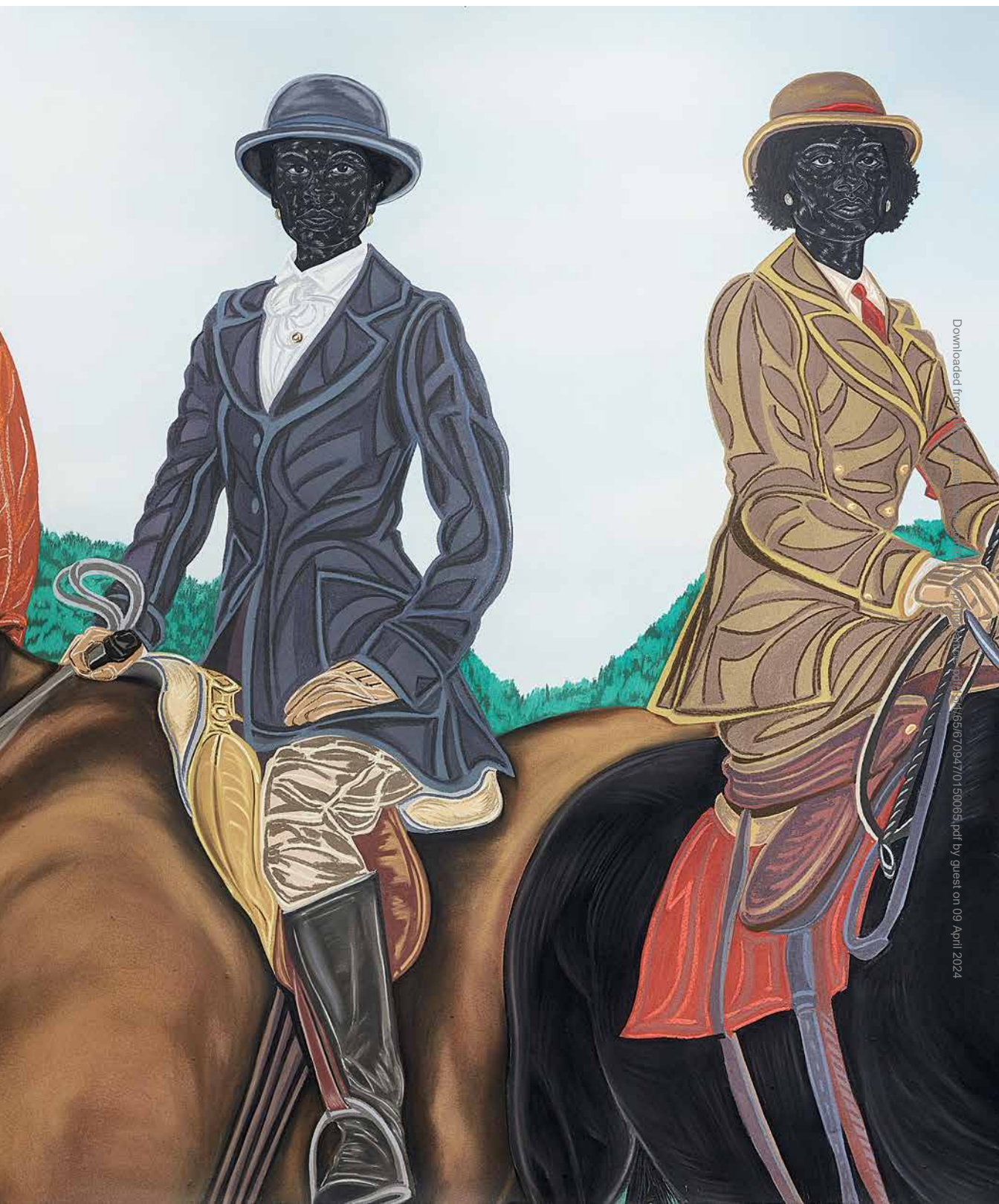
Figure 1 Hunting Season (Mother & Daughter) , 2016. Charcoal, pastel, and pencil on paper, 59 × 70½ in. © Toyin Ojih Odutola. Courtesy the artist and Jack Shainman Gallery, New York.