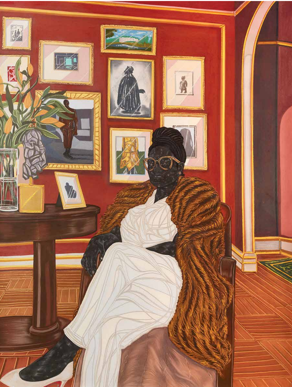
Figure 2 The Marchioness , 2016. Charcoal, pastel, and pencil on paper, 77½ × 50½ in.