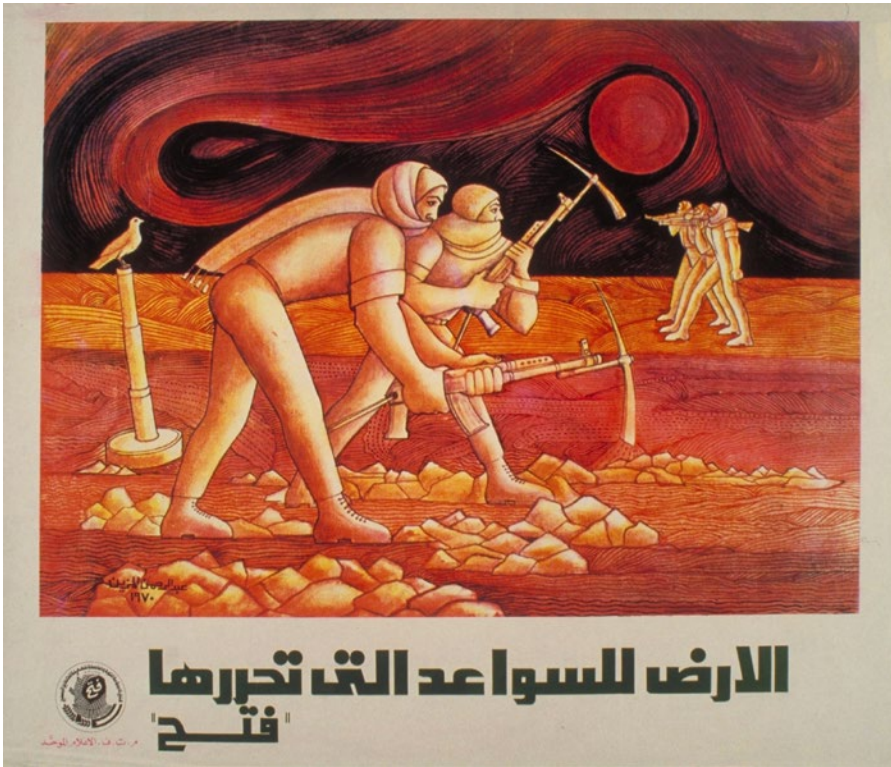
FIGURE 2. “The land is for the hands that liberate it.” ‘Abd al-Rahman al-Muzayyin, PLO Unified Information (1980).

to the future.” 99 It necessarily involves, he writes, a loop or short circuit between pre- and postcapitalist references. In this sense, the communal and the anticolonial share a distinctly demonstrative or prefigurative politics that is always already here and yet to come, a politics that “comes to be produced as something that will have been .” 100